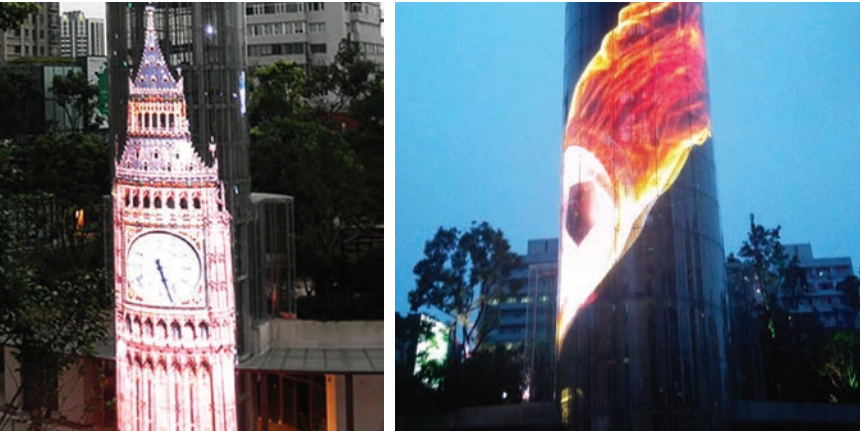
Shanghai Arch Walk, Shanghai, China

The Cylinder series is a superior transparent LED display that can be custom designed to form a unique cylinder shaped display to add pizzazz to your exhibit. Each cylinder is formed by four lightweight quarter curves and is custom built to any diameter or height, delivers high transparency, and unbeatable brightness. ClearLED Cylinder provides an excellent lightweight centerpiece exhibit.