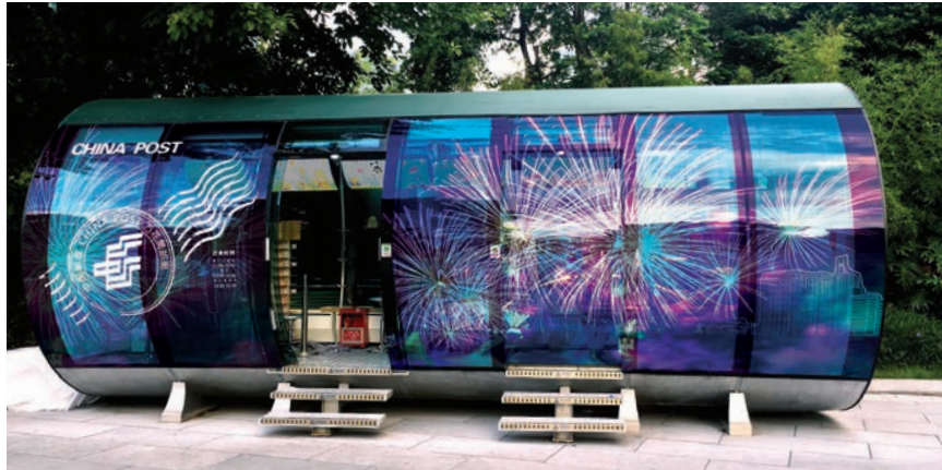
China Post, Guangzhou, China

The Curved series transparent LED display is fully customizable to form a convex or concave arch. Curved panels are pre-engineered and manufactured to meet the exact degree of curve for your display and shipped pre-formed. Highly transparent, lightweight, and exceedingly bright, ClearLED Curved will make your brand stand out from the crowd.