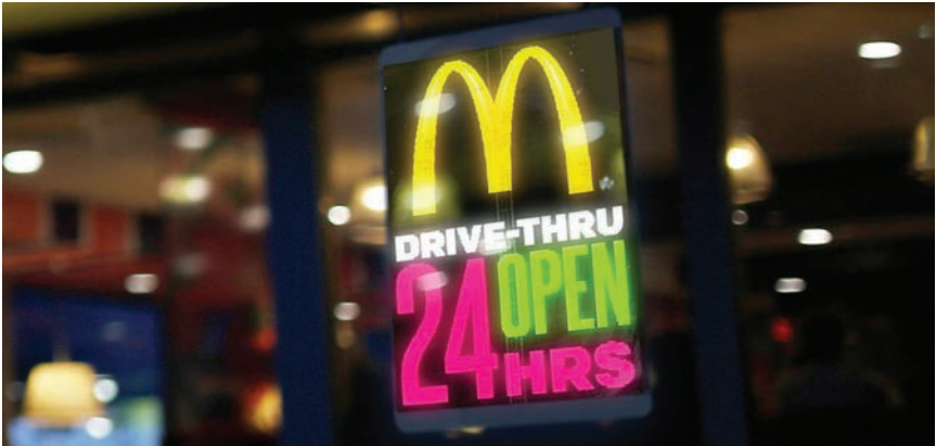
McDonald's, Hattiesburg, Mississippi, USA

The all-in-one Poster is a transparent digital indoor poster designed with convenience in mind. These portable lightweight transparent LED displays can be purchased ready-to-go (42", 55", and 63") and can be installed in not time—everything you need is included in the box. The Poster series has a track record of boosting sales and delivers a return on investment that’s hard to beat.